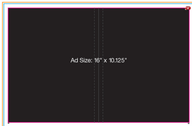
Double Page Ad without Bleed (Allow .75" space in the middle with non-critical information)