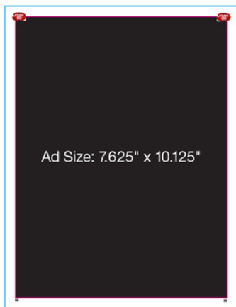
Full Page without Bleed