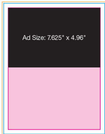
Half Page Horizontal