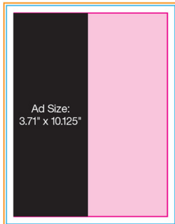
Half Page Vertical